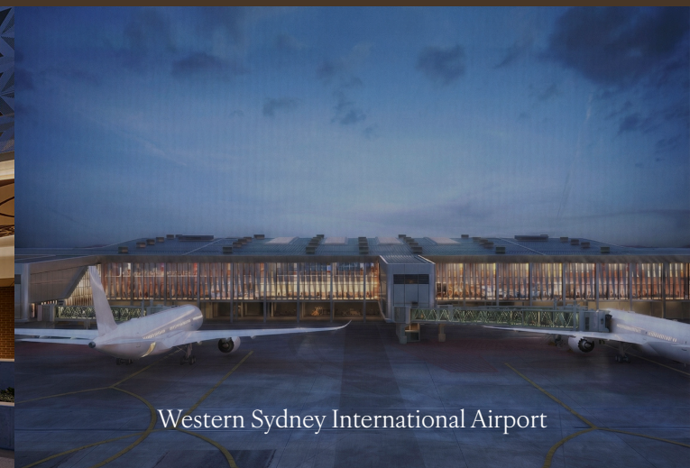
Western Sydney International Airport