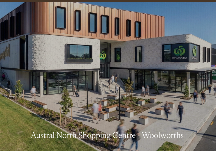
Austral North Shopping Centre - Woolworths

Planned upgrades to Fifteenth Avenue will further enhance east-west movement, while the proposed fast-transit link to the airport precinct will strengthen long-term accessibility.