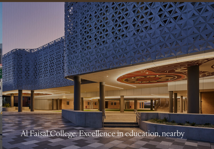
Al Faisal College. Excellence in education, nearby